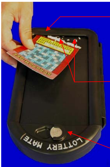
TICKET STORAGE / OPENS LIKE A BOOK